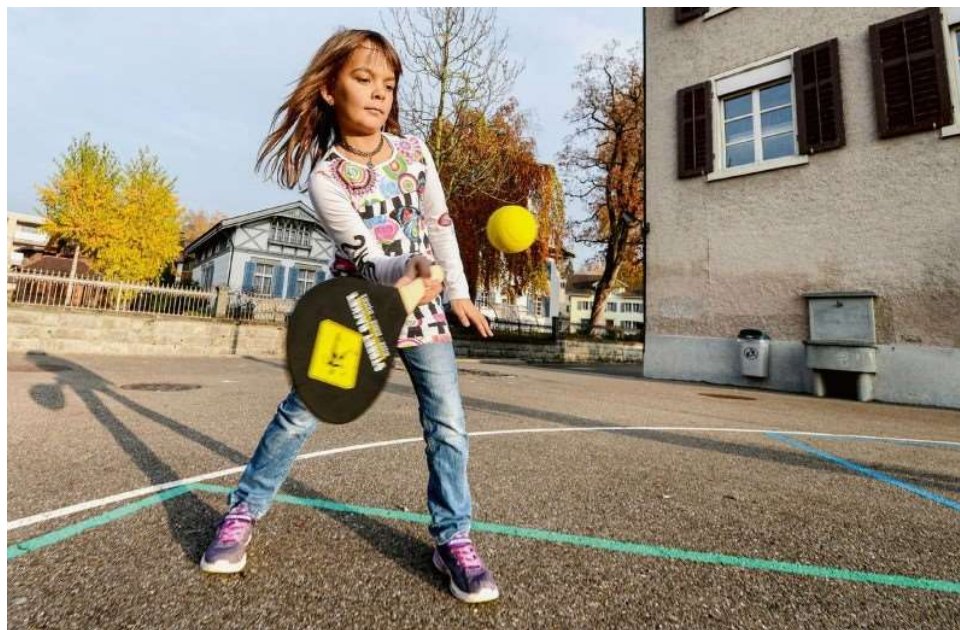
Real play instead of online gaming, preferably in the fresh air: The Swiss Street Racket concept is great for our health -- young and old and for the whole community!

Street Racket can be played both indoors and outdoors and offers an array of exciting activities, forming a diverse range of competitive games and areas of use. The association Street Racket supports communities with the introduction of Street Racket.